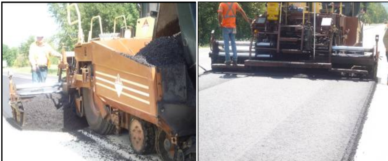
Figure 8. Placing Rubber Asphalt Warm Mix

The compaction train consisted of a 2003 Ingersoll Rand DD90 steel wheel vibratory roller for breakdown, a 2004 Bomag DUR24R rubber tire roller for intermediate compaction and a Bomag steel wheeled roller for finishing (Figure 9).