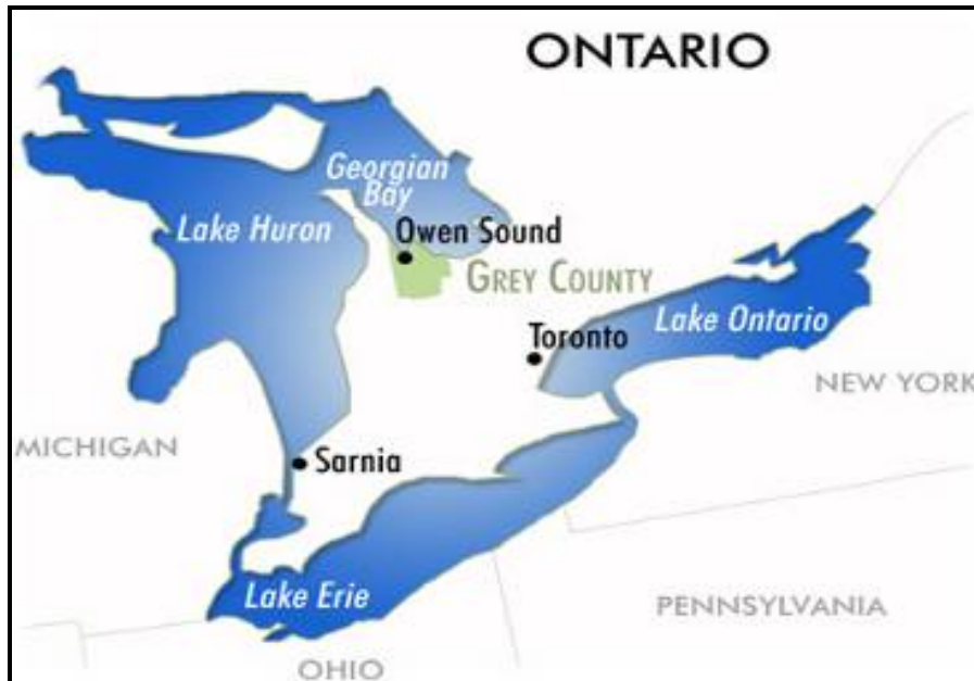
Figure 1. Grey County, Ontario Location Map

Disposal of waste tire is an environmental concern in Ontario. According to Used Tires Program Plan prepared by Ontario Tire Stewardship in February 2009, the current scrap highway tire generation is about 13 million Passenger Tire Equivalent (PTE's) of which 0.8 million PTE's go to the landfills [5].