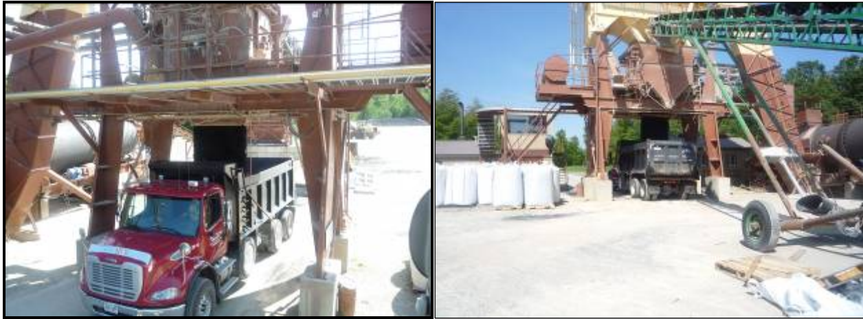
Figure 3. Loading Trucks at Plant - No Fumes Observed during Production