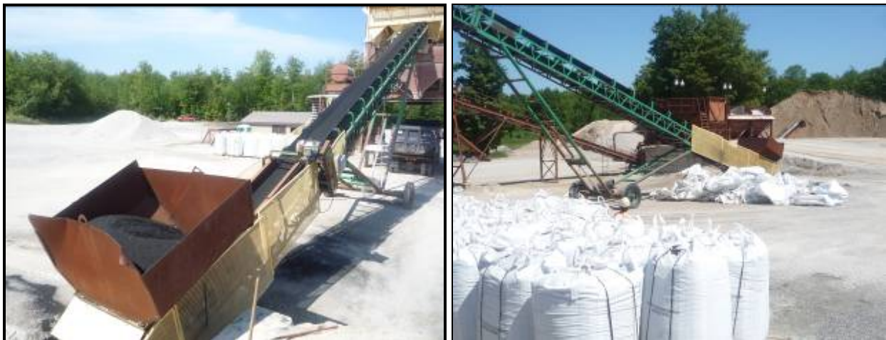
Figure 6. Crumb Rubber in Bags and Feed System

In order to add the crumb rubber with the dry process mix, the reclaimed asphalt feeder system was utilized; the bags of crumb rubber were cut open and carried up to the Pugmill to be mixed with the aggregate (Figure 6). No problems were encountered during the production, with exhaust emissions significantly decreased and burner fuel consumption reduced at the lower mixing temperature levels.