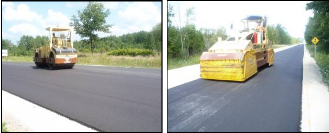
Figure 9. Rubber Asphalt Warm Mix Breakdown and Intermediate Rolling

Density checks showed that the mix could still be compacted further and the compaction train continued until the mat cooled down to below 80°C. The mix during placement showed minor signs of roller and tear marks on initial compaction, but after final breakdown compaction and finished rolling was completed these surface imperfections were eliminated. The finished mat seal up tight (Figure 10).