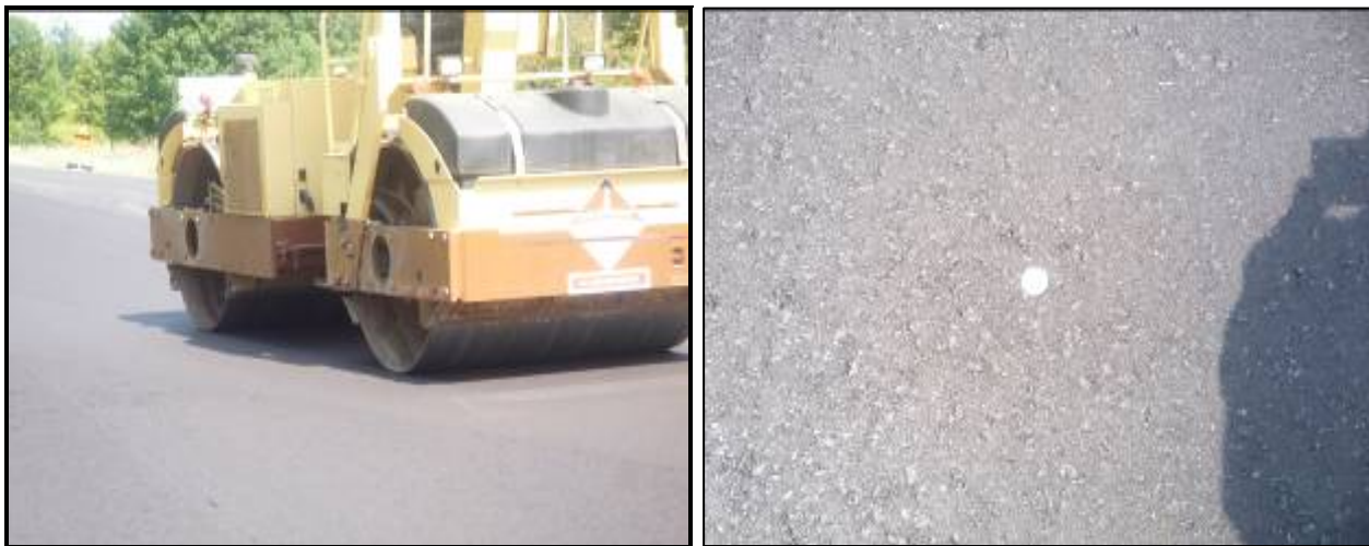
Figure 10. Rubber Asphalt Warm Mix Finished Mat

Density checks showed that the mix could still be compacted further and the compaction train continued until the mat cooled down to below 80°C. The mix during placement showed minor signs of roller and tear marks on initial compaction, but after final breakdown compaction and finished rolling was completed these surface imperfections were eliminated. The finished mat seal up tight (Figure 10).