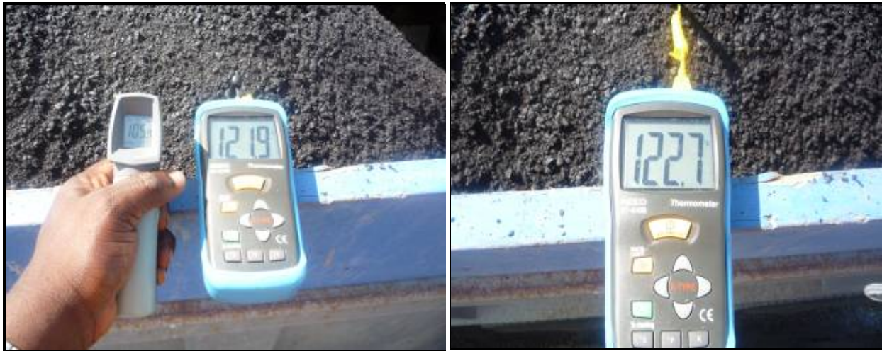
Figure 5. Rubber Asphalt Warm Mix Temperature during Hauling

In order to add the crumb rubber with the dry process mix, the reclaimed asphalt feeder system was utilized; the bags of crumb rubber were cut open and carried up to the Pugmill to be mixed with the aggregate (Figure 6). No problems were encountered during the production, with exhaust emissions significantly decreased and burner fuel consumption reduced at the lower mixing temperature levels.