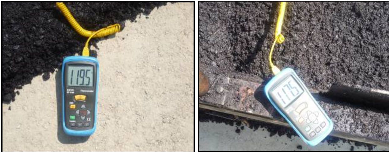
Figure 7. Rubber Asphalt Warm Mix Temperature in Paving