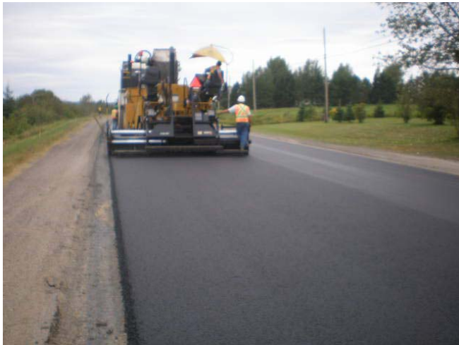
Pic 3: Uniform texture behind screed