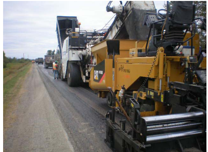
Pic 4: Shuttle buggy ensuring constant paver movement and smoother mat

Please do not hesitate to call if you have any questions or comments.