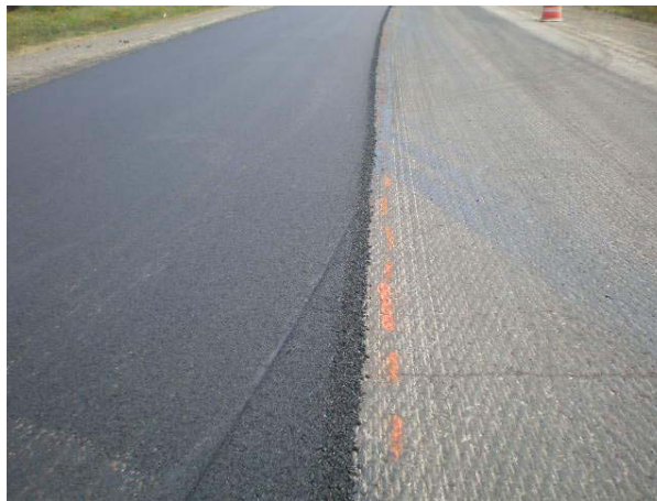
Pic 1: DD Vib turning off very stable unconfined edge